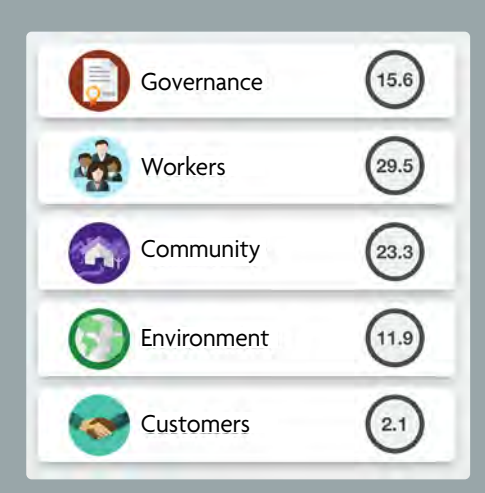
Figure 1. B Impact Report: Overall B Impact Score<sup>1</sup>

<sup>1</sup>To certify as a B Corp, a company must achieve a minimum verified score of 80 points on the B Impact Assessment. The B Impact Assessment asks questions about how the day-to-day operations of a company create positive impact for the company's workers, community, and environment. Additionally, companies can earn further points if their overall business model can be shown to create positive social and environmental impact as well, qualifying the company for specific Impact Business Model points. The non-profit B Lab. verifies scores for Certified B Corporations.